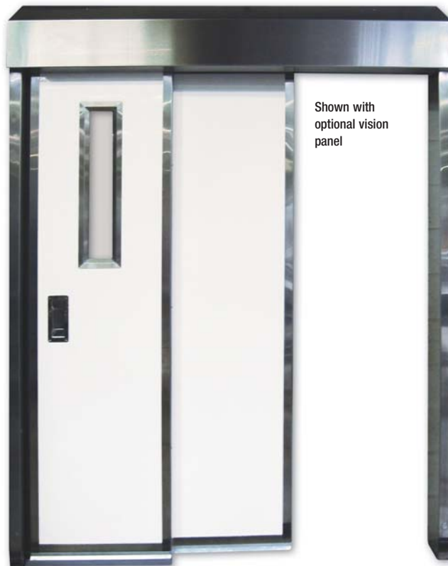
Shown with optional vision panel

Bold Innovation. Superior Design. Unsurpassed Quality.