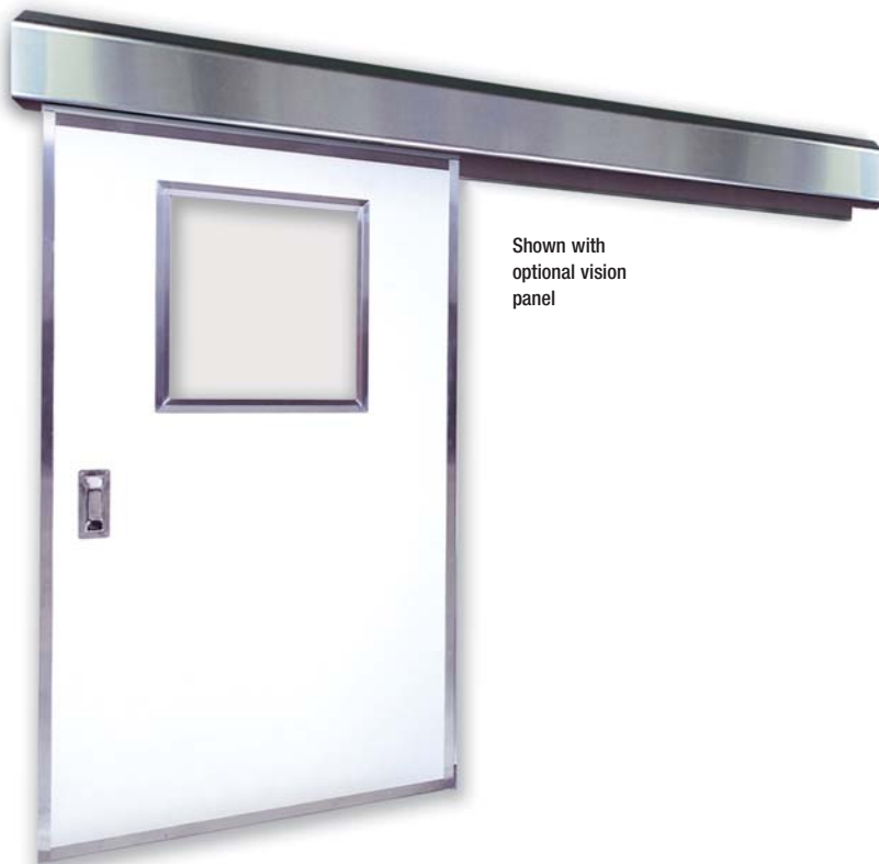
Shown with optional vision panel

Innovative Design. Superior Quality. Exceptional Value.