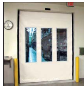
Vertical Vision Panels - Optional