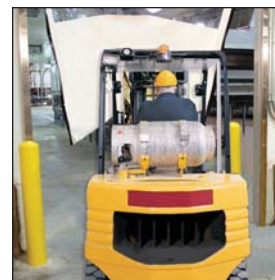
Breakaway With Auto Reset