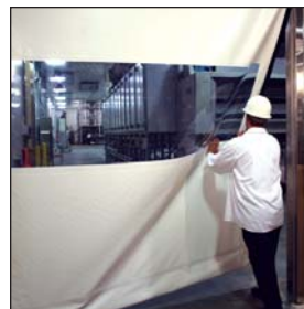
Manual Release/ Emergency Egress