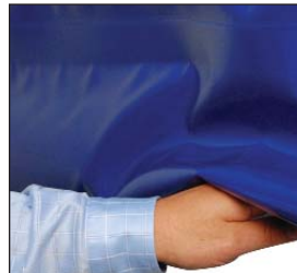
Wireless, Soft Bottom Edge