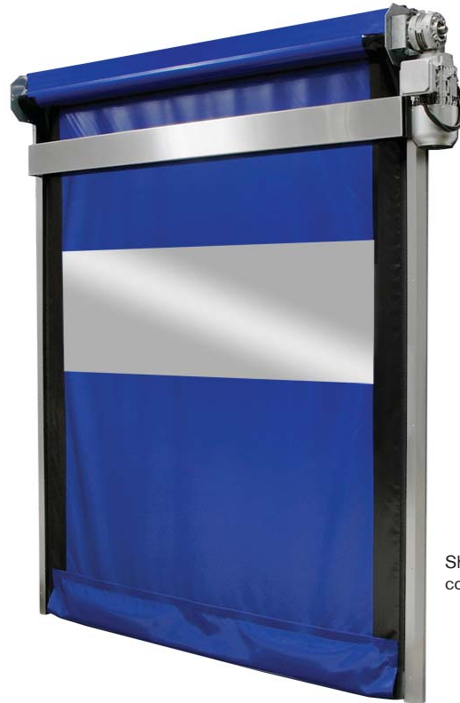
Shown with optional side covers and full vision panel.

Innovative Design. Superior Quality. Exceptional Value.