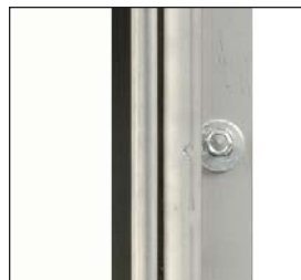
Ultra Low Profile