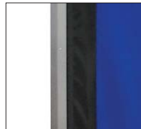
Optional Side Guide Cover