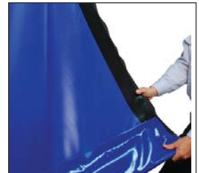
Breakaway With Auto Reset